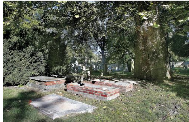
Many members of the Burwell family are buried in the Old Chapel cemetery in Clarke County These graves were damaged when a large tree limb fell on them several years ago.

The new stones will be in the old style, with identical lettering, size, and style. The material will change, however, with granite replacing marble. The former will hold up much better than the latter, Shade added. The new stones, being carved in Elberton, Ga., will not be ready for Sunday's service, Shade said.