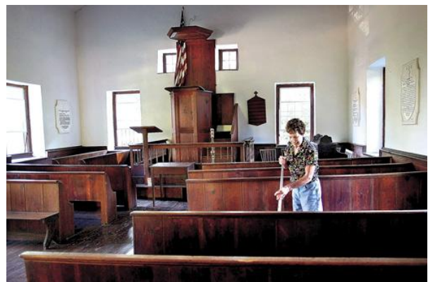
Many members of the Burwell family are buried in the Old Chapel cemetery in Clarke County These graves were damaged when a large tree limb fell on them several years ago.